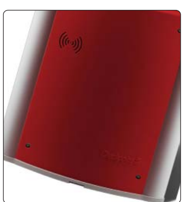
*Ruby Red optional colored base cover shown above

The EVOLVE iRange P30's slim and attractive design provides excellent detection and can be enhanced with an integrated people counter unit. Perspex advertising panels come as standard for display of promotions, brands or information.