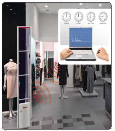
EVOLVE iRange P30 without advertising panel inserts